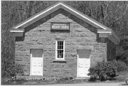
Narragansett Indian Church

Oral History relates on the 6th Moon since time immemorial